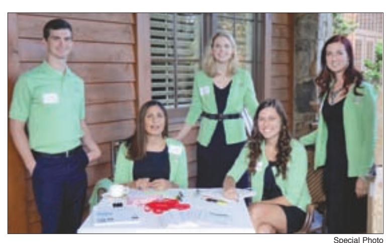
Some of our staff ready for the post tournament dinner